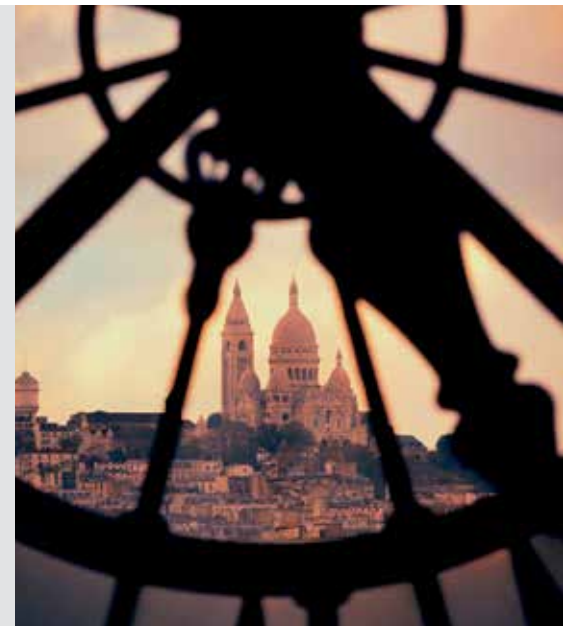
SACRÉ-COEUR VIEWED FROM MUSÉE D'ORSAY

Prepare to immerse yourself in the spectacle that is Paris at Christmastime. Scour the shops along the Champs-Élysées, stop for a latte and croissant, and keep right on going. You'll also have plenty of time to see can't-miss sites like the Louvre, the Eiffel Tower, Sacré Coeur, Musée d'Orsay and more.